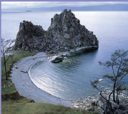
Olkhon Island, Lake Baikal

For more information, please visit www.tahoebaikal.org